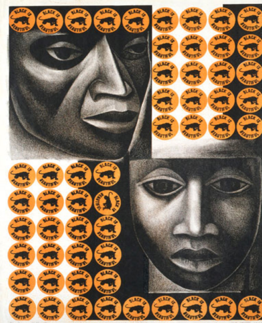
14. ELIZABETH CATLETT, NEGRO ES BELLO II (BLACK IS BEAUTIFUL), LITHOGRAPH, 1969