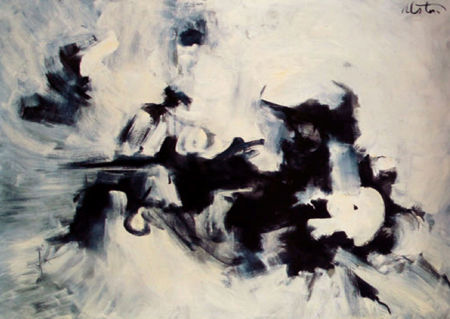
3. CHARLES HENRY ALSTON, BLACK AND WHITE NO. 7, OIL ON CANVAS, 1961